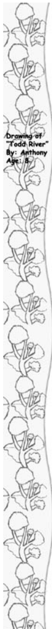
Drawing of "Todd River" By: Anthony Age: 8