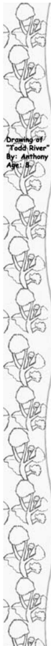
Drawing of "Todd River" By: Anthony Age: 8

The wide and sandy riverbeds lined by large and attractive river gums are a core feature of Alice Springs. Regrettably, there are degrading impacts affecting both the visual appeal and the health of the area. These impacts include river camping, litter, fire, weed infestation and disused infrastructure. Access to the rivers for recreational use is unstructured, incomplete, and in the eyes of many, unsafe.